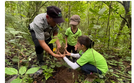
Students from Escuela Ecológica de la Tigra plant a tree with one of MCL's forest guards

Back in July, thanks to the support from our incredible donors, Friends of the Rainforest was able to provide the Monteverde Conservation League (MCL) with a grant of $6,365 to help cover the costs of their most recent educational program targeting local kids. This grant allows MCL to implement one-day excursions to the Children's Eternal Rainforest for approximately 300 children by helping to cover the field trip transportation, lunch for the participants, and a portion of the salary and benefits for the environmental educator responsible for running the program.