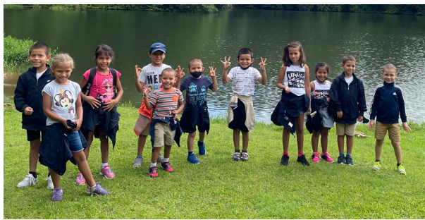
Children from the local orphanage by Pocosol lake

Since mid-October, MCL has successfully hosted six different field trips with 99 total participants! For most of these trips, the children and families visited the Finca Steller Station (MCL's base of operations on the Caribbean slope of the Children's Eternal Rainforest) and saw a presentation about climate change and the importance of protecting the Rainforest. Then they were taken on a tour of the paths, and each child was able to plant a tree. At the end, there was time for reflection so the children could draw or write about what they had seen and learned.