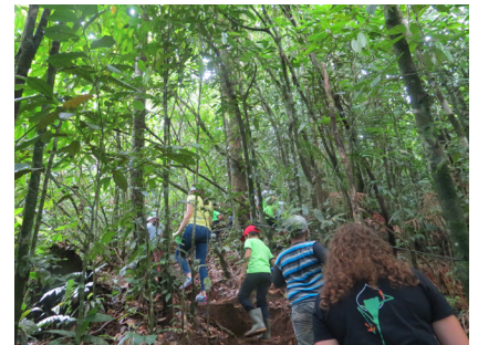
Students from Escuela Ecológica de la Tigra travel through the Rainforest.

Traveling silently through the Rainforest is difficult with a group of 20 children, so it was difficult to see some animals in their natural habitat. With that in mind, the children learned the importance of being quiet while moving through the forest, and they were still able to see frogs, snakes, hens, cat tracks, and some great tinamou (mountain hen) eggs.