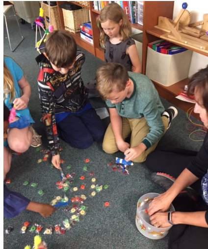
Fulton School students bioengineering bird beaks to learn about animal adaptations in the rainforest.

Through generous donations, we have reached and inspired over 360 students in the St. Louis area since January. By instilling an appreciation and understanding of the delicate biodiversity of the rainforest, we are able to plant seeds of understanding in today's youth. Students that understand the importance of preserving the rainforest will be more likely to grow into adults that actively protect it. We know teachers often lack the resources and time to educate students on the importance of the rainforest. Some school districts have even opted out of having rainforest lessons in their curriculum guides, so the only time students hear about the rainforest is the time we spend with them.