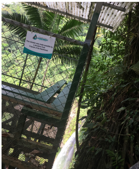
Scenic waterfall overlook made possible by you!