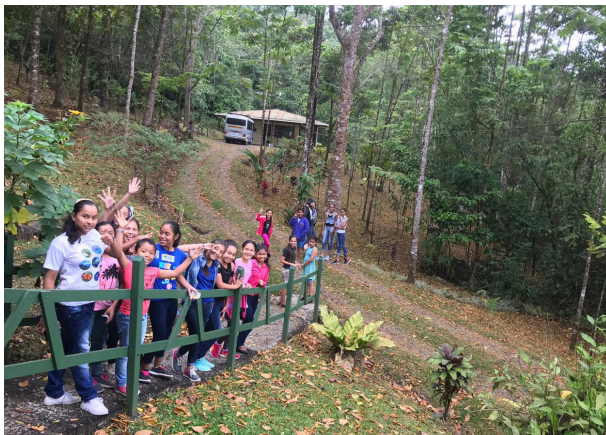
CAN fieldtrip to Finca Stellar

We are delighted to report steady visitation at our Pocosal field station, by international and local visitors alike. Nature lovers at Pocosal are enjoying spectacular birdwatching, as well as the new and improved scenic lookout ("mirador") at the Pocosal waterfall. The mirador was rebuilt in galvanized steel in 2016 thanks to a grant from Friends of the Rainforest in 2016. In February 2019, we moved the mirador back from the edge of the bluff and raised it further, permitting a better view of the waterfall while also ensuring security for visitors.